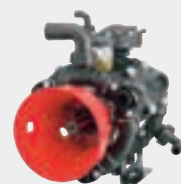
LT-140-C poly pump