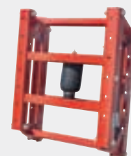
LT-GB383899000V airbag suspension