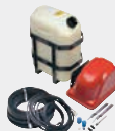
SAL901654A foam marker